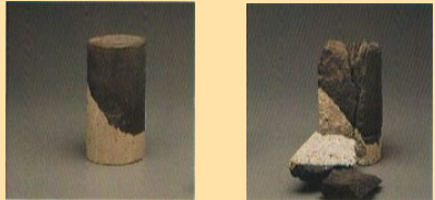
ASTM shear bond test. Thermbond's strength is tougher than the base material. Note: No failure occurs through the bond plane.