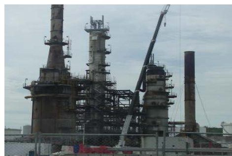
HYDROCARBON AND REFINERIES